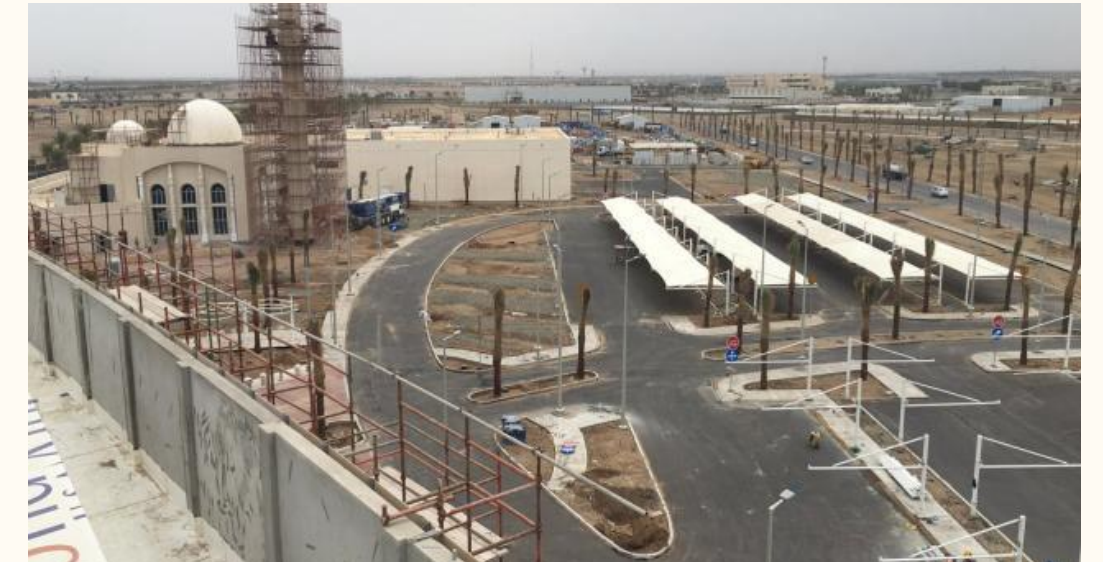
TTDP, Masjid Omar bin Khattab PBH Car Parking

Professional finishing of car parking facilities with durable surface treatments, clear line marking, and structural integrity. Our work ensures safe, functional, and aesthetically pleasing parking infrastructure that meets the highest quality standards.