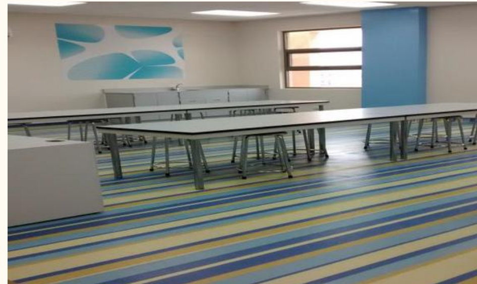
TTDP, School Projects, Lab & Classroom Finishing work for floor tiles, walls, ceiling, and painting activities