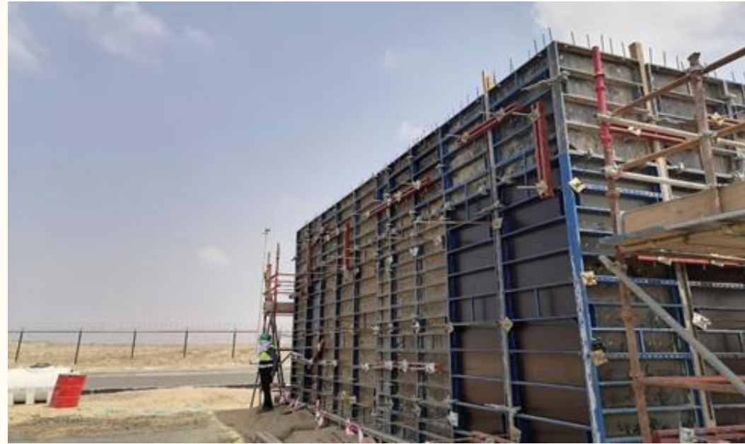
ROSTP Plant, Guard House, Jazan Economic City