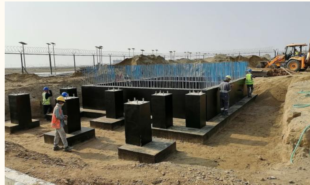
ROSTP Plant, Guard House, Jazan Economic City