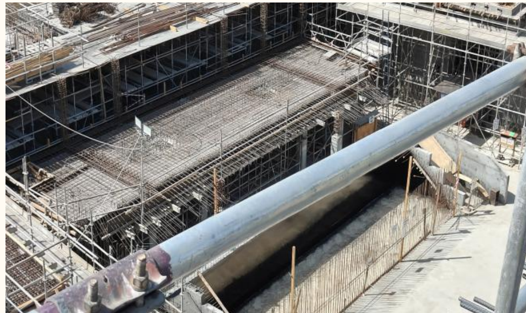
Floor Slab, Rear and Shuttering for the building at Dhahran