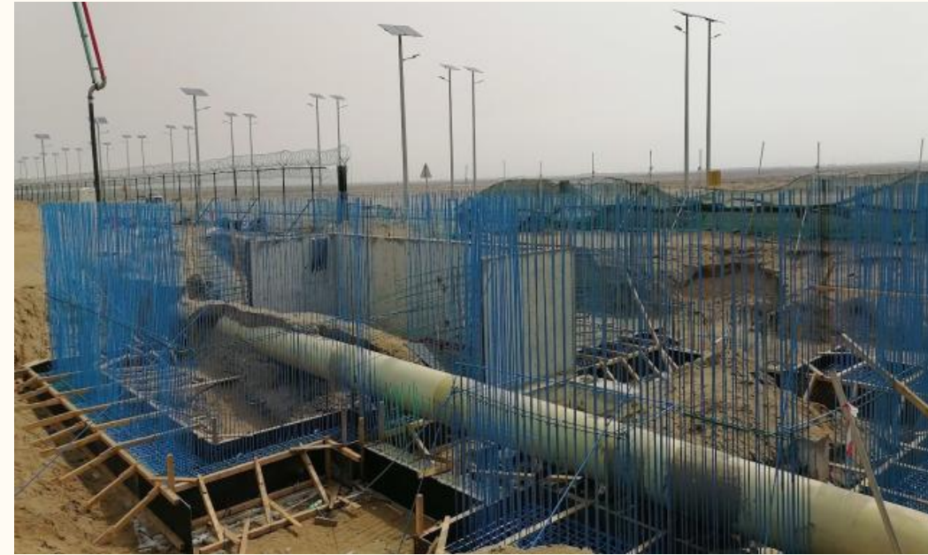
ROSTP Plant, Gate House, Jazan Economic City