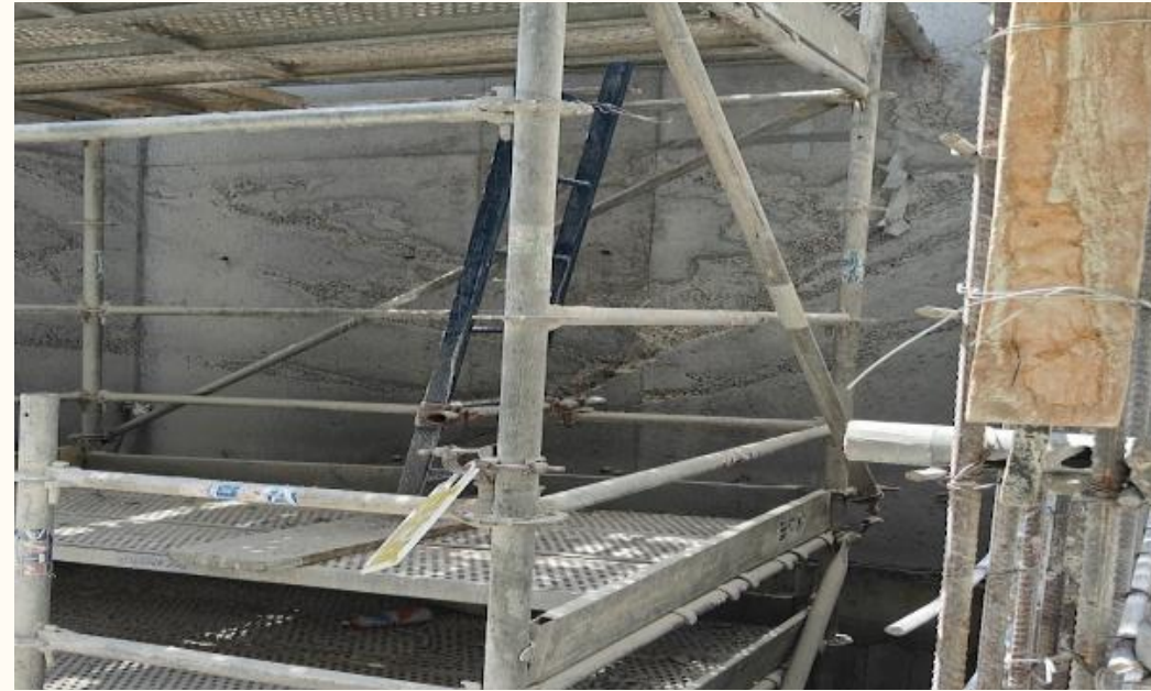
Repair of Concrete Shaft due to Honeycomb