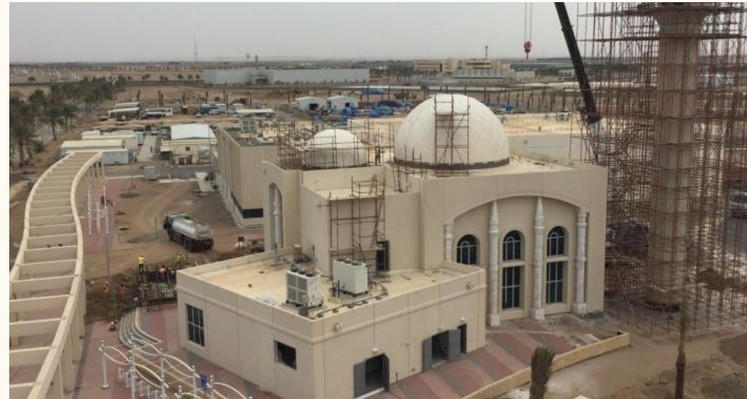
TTDP, Masjid Omar bin Khattab PBH interior finishing

Comprehensive interior finishing and precast wall panel installation for Masjid Omar bin Khattab. Meticulous attention to detail in wall treatments, flooring, and ceiling work, delivering a space of dignity and lasting quality for the community.