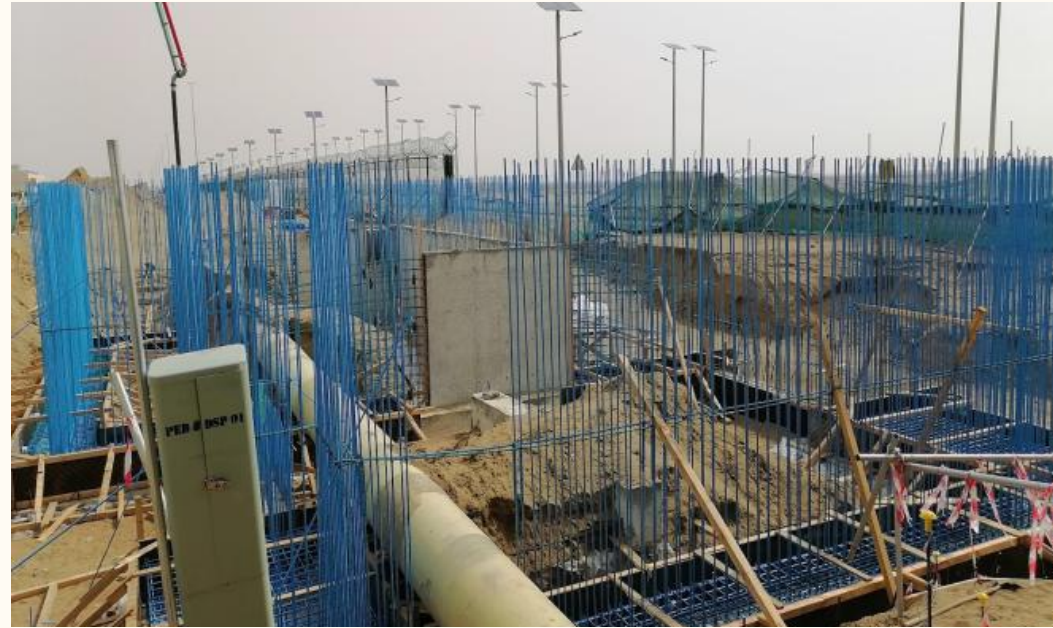
ROSTP Plant, Gate House, Jazan Economic City