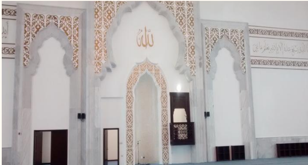
TTDP, Masjid Omar bin Khattab PBH interior finishing

Comprehensive interior finishing and precast wall panel installation for Masjid Omar bin Khattab. Meticulous attention to detail in wall treatments, flooring, and ceiling work, delivering a space of dignity and lasting quality for the community.