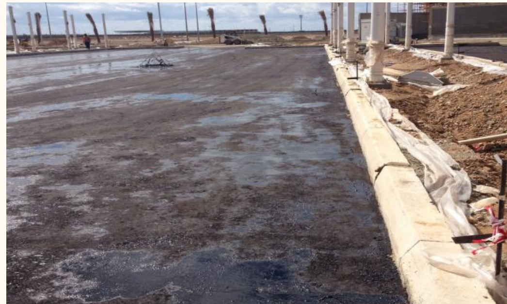
Road & Asphalt at KRPSF