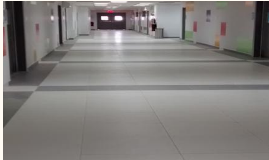
TTDP, School Projects, Classroom, Corridors Finishing work for floor tiles, walls, Ceiling and Painting activities