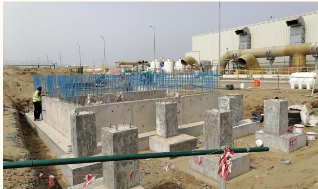
ROSTP Plant, Guard House, Jazan Economic City