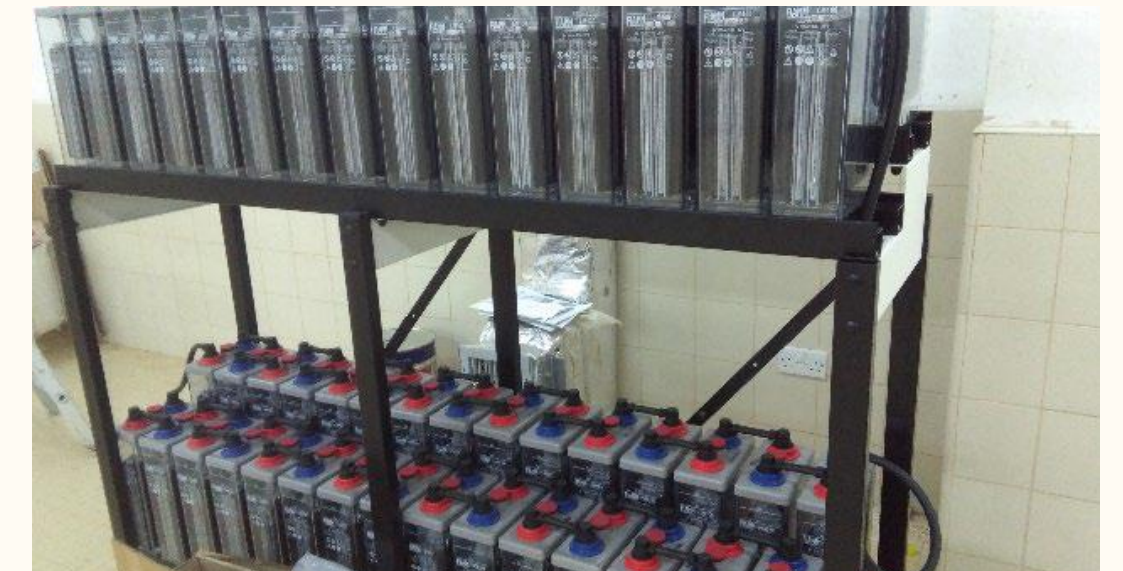
Battery Bank, Installation, Load Testing