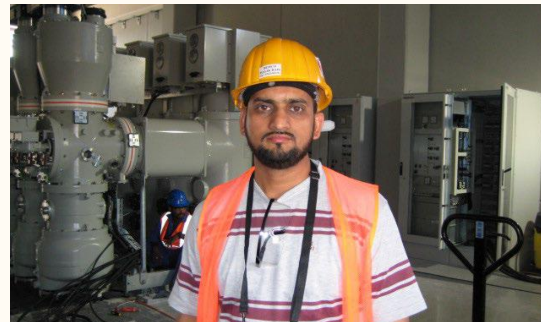
NDIA (Doha-Qatar International Airport, Installation of 66kv GIS Bay Installation