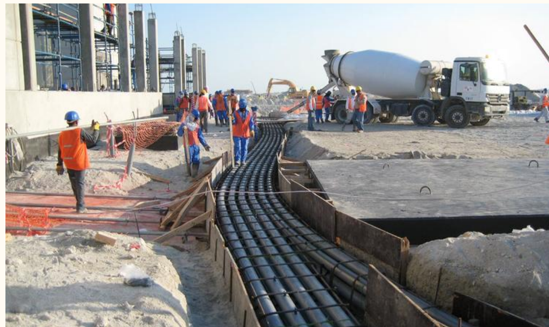
Duct Bank Installation