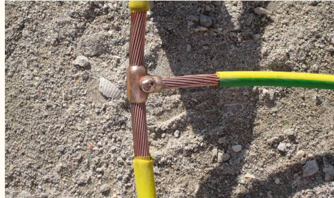
Cadwelding for Substation Equipment Grounding