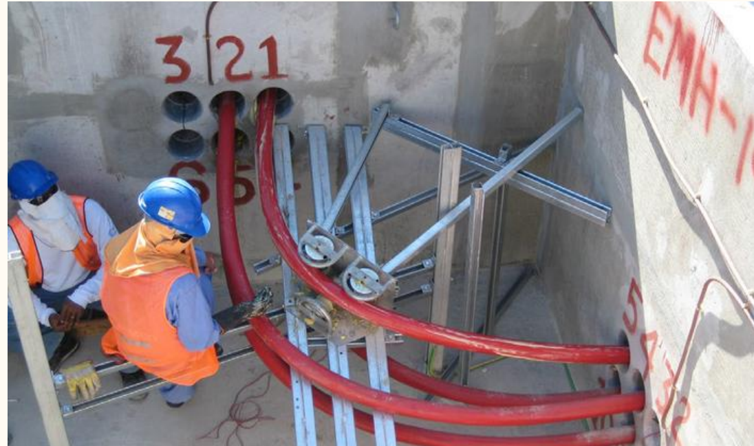
MV Cable pulling Inside Manhole