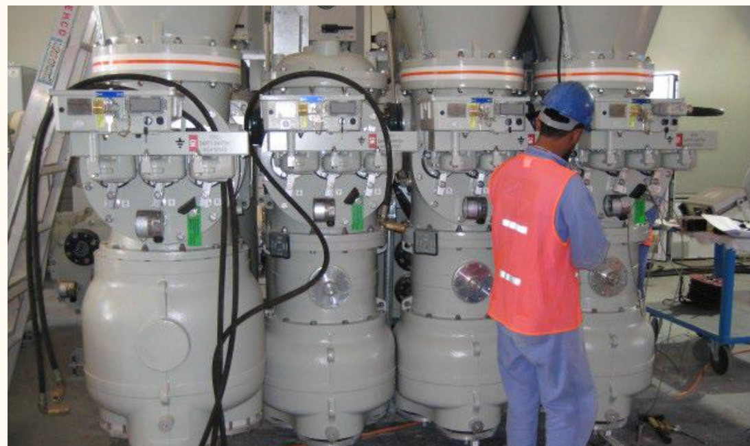
NDIA (Doha-Qatar International Airport, Installation of 66kv GIS Bay Installation