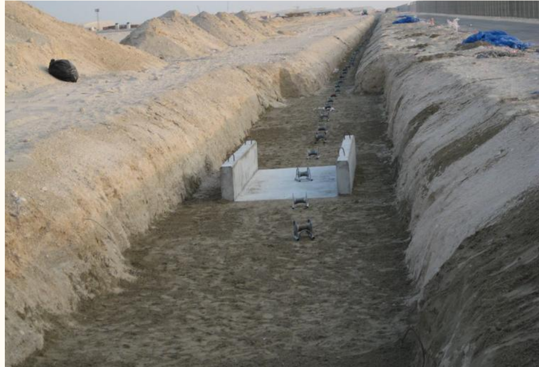
66kv HV Cable Installation