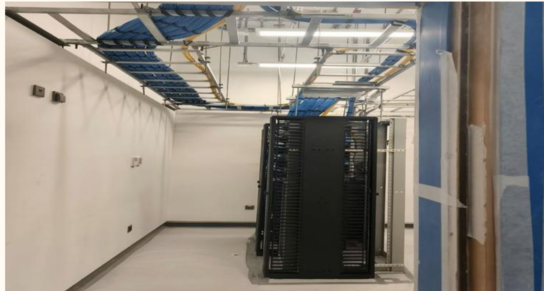
TER room Equipment and Cable Management