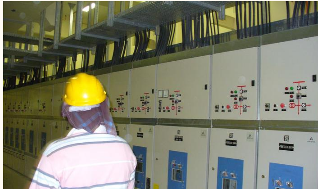
NDIA (Doha-Qatar International Airport, Installation of 11kv Switchgear, Cable Tray and Cable Pulling & Termination