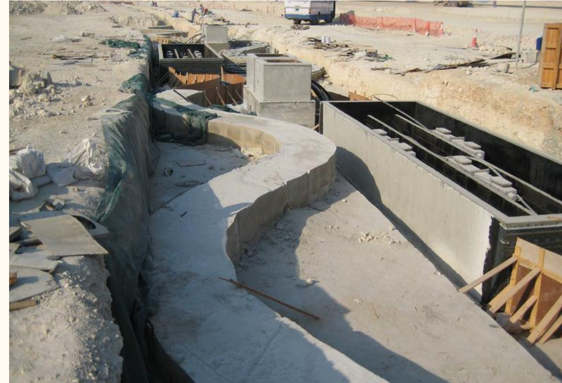
66Kv HV cable Installation laying & Splicing