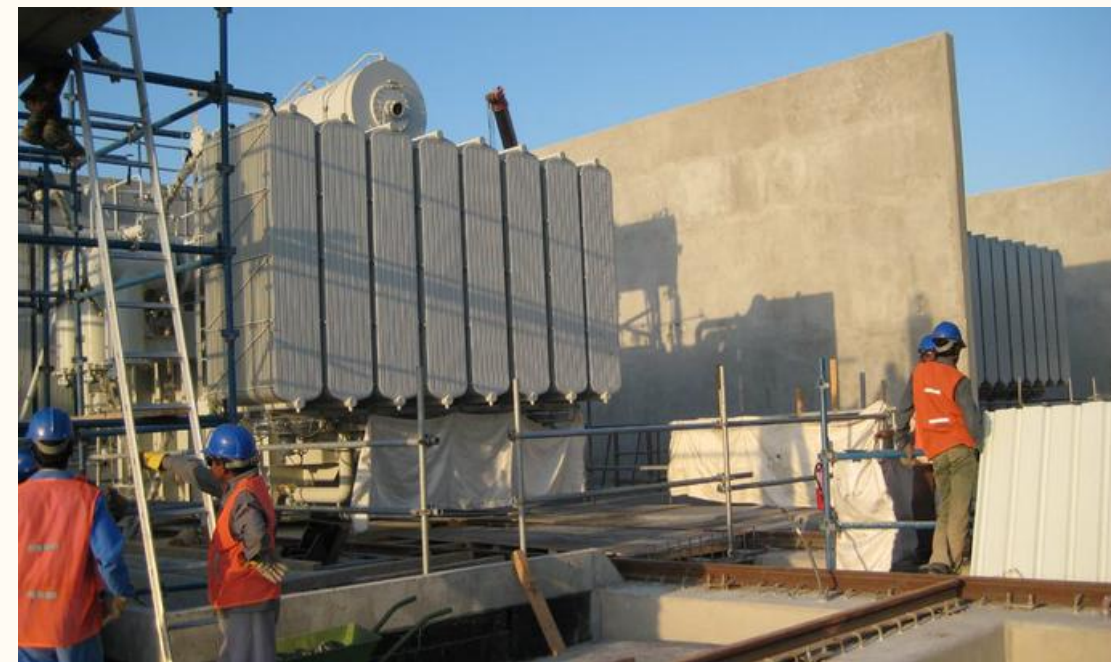
50MVA, 66/11KV Oil Filled Transformer Instn