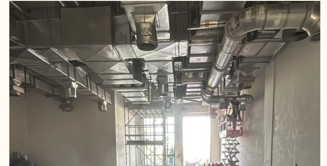
HVAC Duct, HVAC Equipment Installation