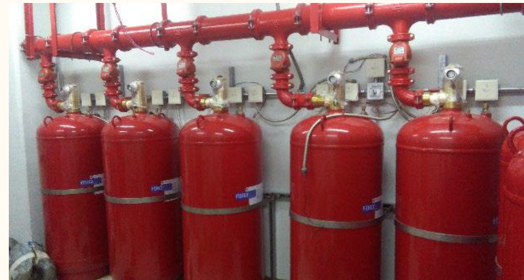
Fire Suppression System