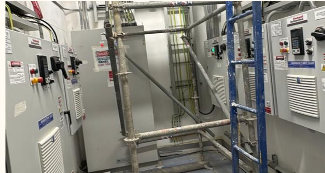
Conduit, Cable TRAY, Panels and VFD installation