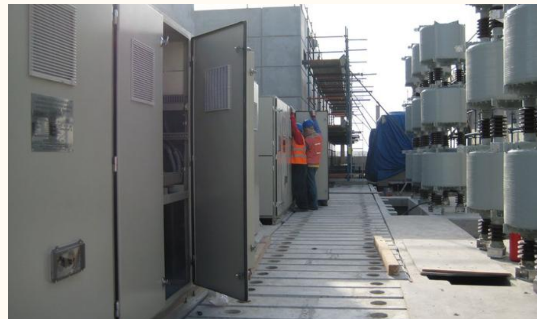
Capacitor Bank & Associated Panel Installation