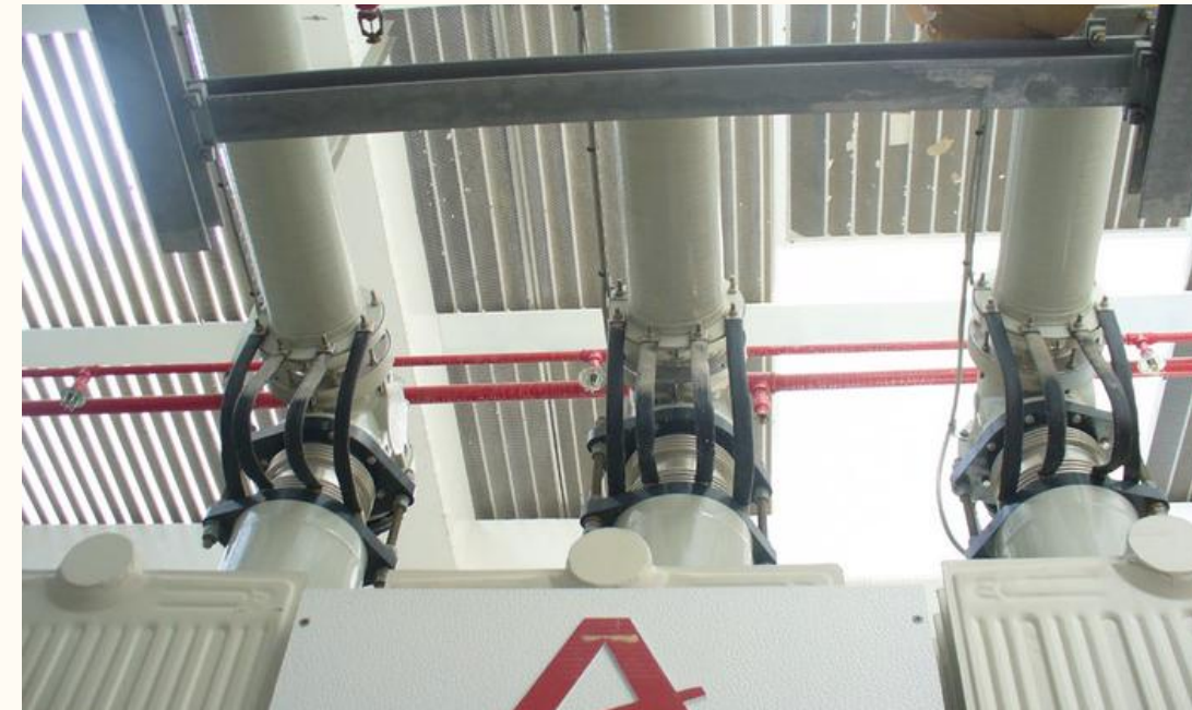
NDIA (Doha-Qatar International Airport, Installation of 66kv GIS Bus Bar Installation from Transformer to GIS Bay-1