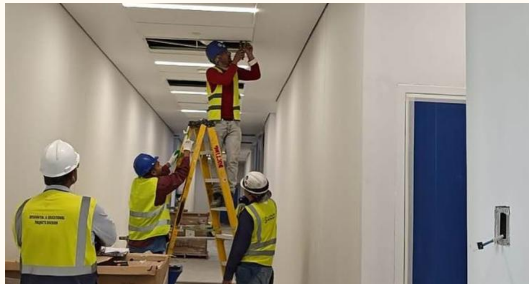
Lighting System Installation