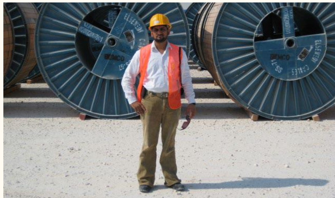
Cable Pulling for 115KV, 66KV, 11KV & 600 V